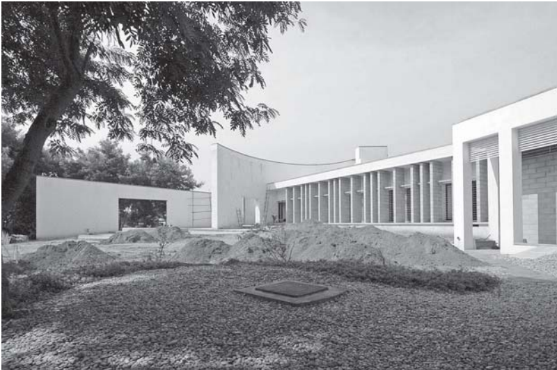
New building, June 21, 2006

The first module of the future Core Building is now complete, and will be inaugurated in August 2006. Meanwhile sanction has been received for a further grant, which will allow completion of the Core Building in the period 2006-08.